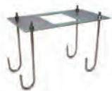
AC 510 FOUNDATION ANCHORING KIT