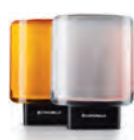
SWIFT LED BLINKING WARNING LIGHTS