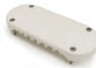
AC 710 BARRIER COVER PLUG