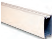
AC 655 ALUMINIUM RECTANGULAR BAR, RAL 9010, 6 M