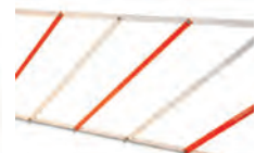
AC 590 2 M CURTAIN