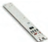
AC 770 INTERNAL LED LIGHTS