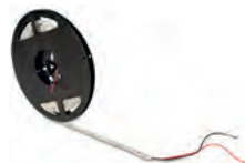
AC 800 5 M LED STRIP