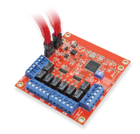
996515PCB&K Integriti UniBus 8 Relay Auxiliary Expander PCB & Accessories (Includes 270mm UniBus patch cable)